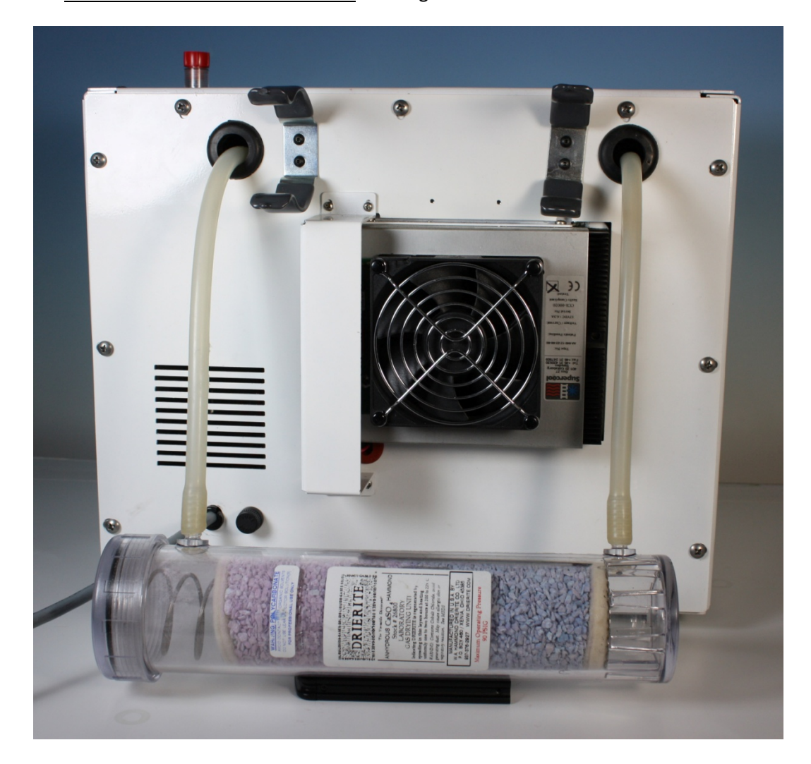
Figure 2: Desiccant Reservoir Pulled From H300