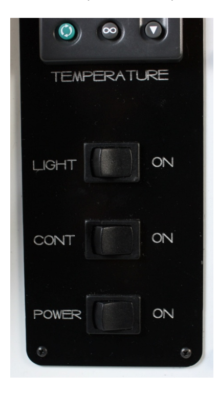
Figure 3: Chamber Controls

The CONT switch allows you to turn off both temperature and humidity control to the chamber without changing the target set point of either controller. Both controllers and the chamber will still be On, but no power will be supplied to the temperature and humidity control units inside the chamber. This switch is useful when you need to open the chamber door.